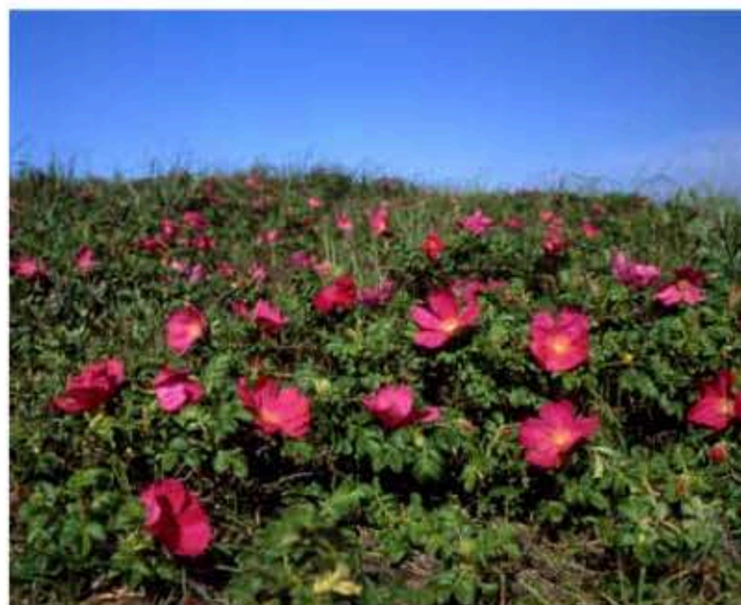
FROM TOP: RUGOSA ROSE, TULIPS, SUNFLOWERS OPPOSITE PAGE, FROM TOP: LAVENDER, GLASSWORT

This delicate bloomer can be a bit tricky to spot – each flower only lasts a day – though June is usually a good